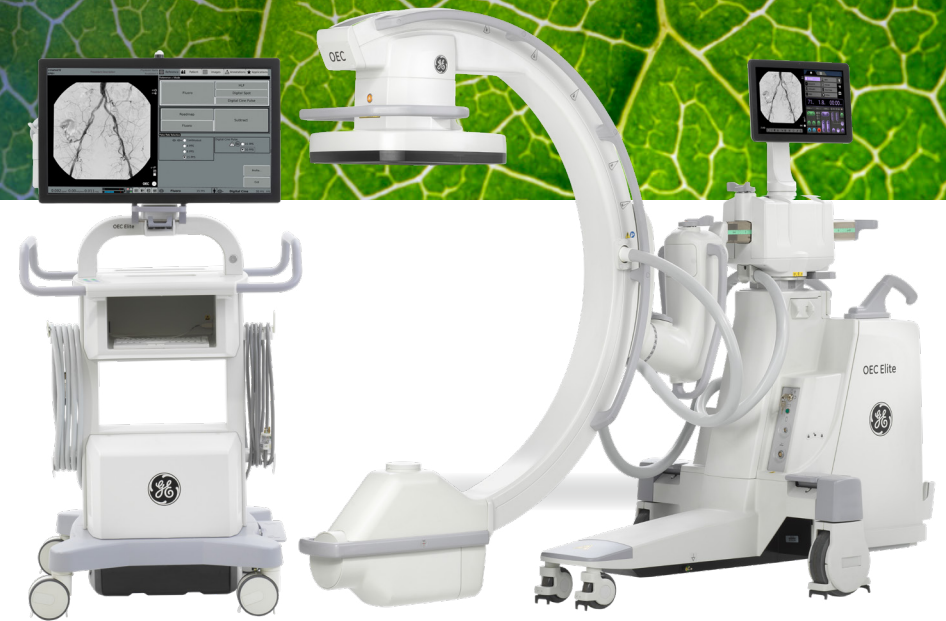
OEC™ Elite CFD premium mobile C-arm